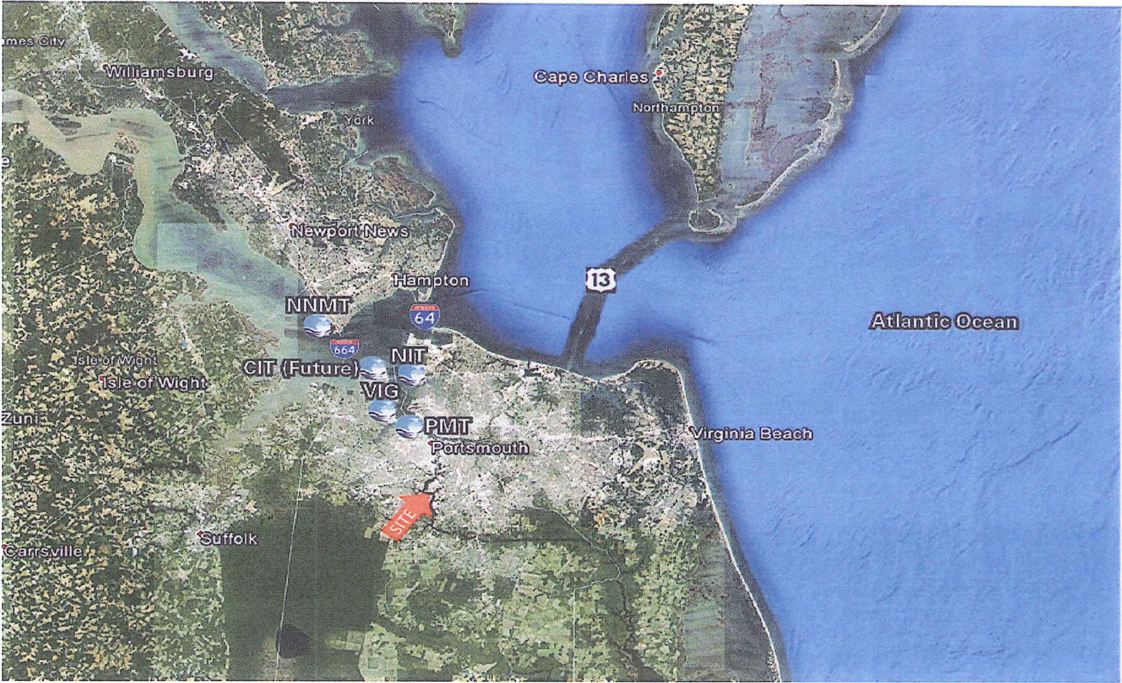
Port of Virginia Terminal Facilities

MARINE TERMINAL 700 ROSEMONT AVENUE, CHESAPEAKE, VA 23324